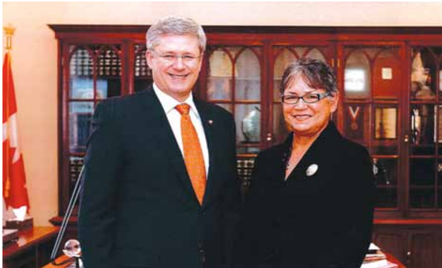
Chief Commissioner Sophie Pierre met with Prime Minister Stephen Harper during the Treaty Commission's visit to Ottawa.

To press for treaty completion in British Columbia treaty commissioners appeared before both the Standing Senate Committee on Aboriginal Peoples and the House of Commons Standing Committee on Aboriginal Affairs and Northern Development in Ottawa.