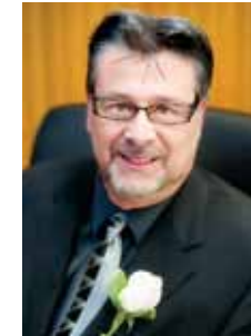
Powell River Mayor Dave Formosa

Newly elected Powell River Mayor Dave Formosa told Update , "The relationship with Tla'amin will only get stronger."